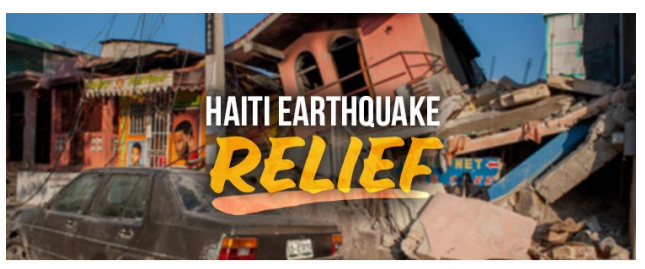
Special Collection | September 18-19, 2021 For the rebuilding of churches, schools, convents, and rectories